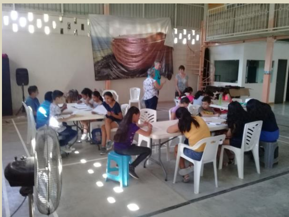
Children come for more than dental care; a Saturday morning English class followed by lunch for hungry students.

In addition to the dental Clinic, La Cosecha houses a medical clinic focusing on health and wellness with special emphasis on maternal and baby health. CIDC also runs various other programs for women and children in the same busy community centre.