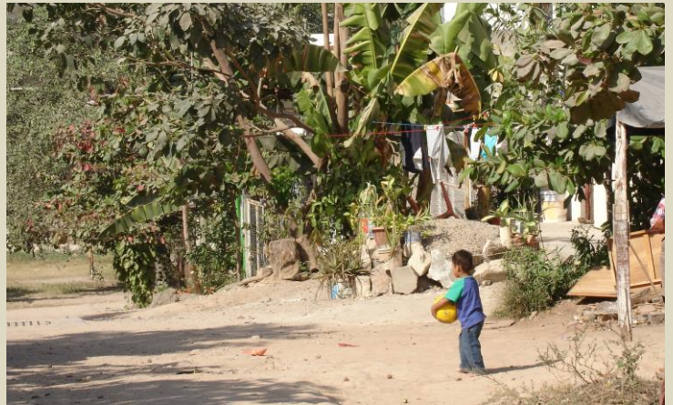
Life in the neighbourhood around the Derksen Clinic.