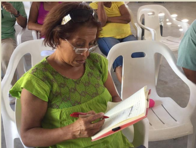
A Derksen Clinic patient filling out paperwork.