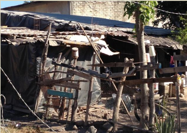
A typical home in the neighbourhood.