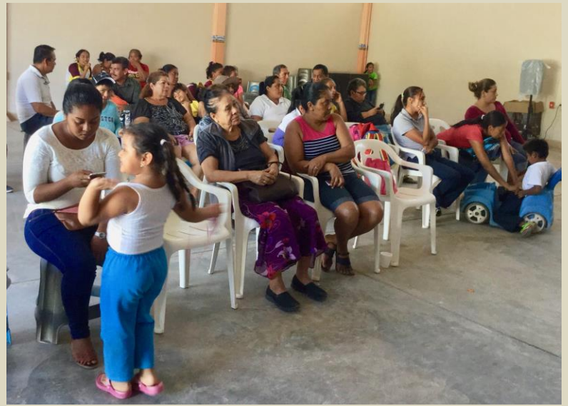
A very full waiting room